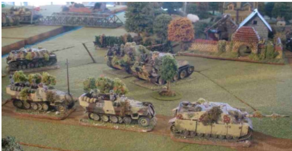
Lead elements of 107 th Panzer Brigade cross the canal and deploy to attack Son

# test as independent AFV ^AT ranges = short 12", medium 36", long 60"