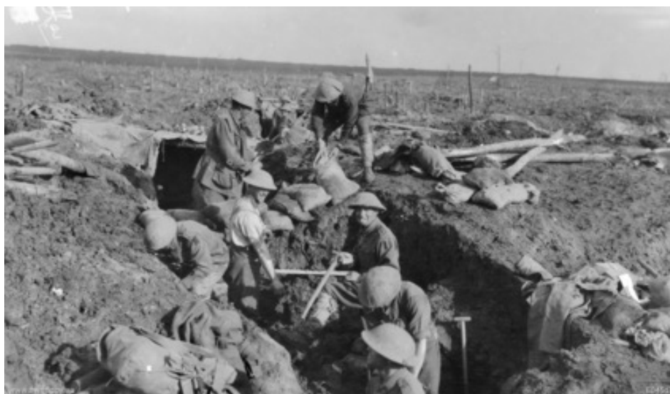
Australian soldiers consolidate in a captured German trench

As the German forces on the Western Front pulled back to a new line of defences (the Hindenburg Line) a series of rearguard actions occurred centred around outpost villages. On the 2 nd April 1917 the battalions of the 13 th Australian Infantry Brigade under the command of Brigadier General Glasgow were tasked with taking the village of Noreuil. The Germans had converted the sunken roads into a line of trenches with barbed wire around the village and had dug a reserve line to the north-east of Noreuil.