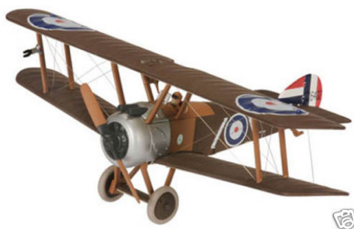
Corgi Sopwith Camel acting as an artillery scout