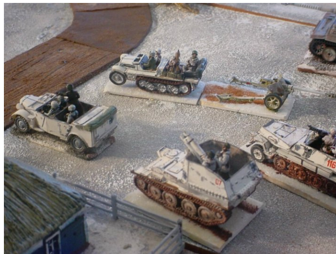
German armour and regimental assets advance on the Soviet held road (various manufacturers)

German forces start embussed and are located north of the line A-B and west of the line C-D. The Germans move first.