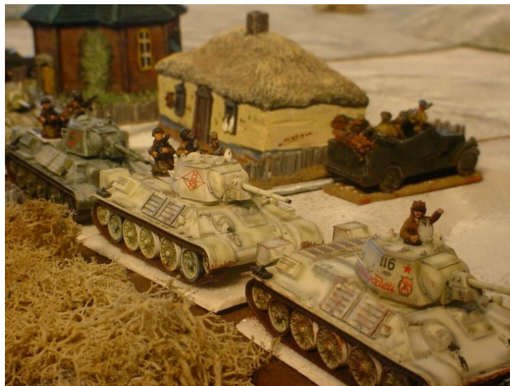
Soviet armour moves through Jeremejewska (Dragon Diecast)

After the liquidation of the Stalingrad pocket, Soviet supply lines had become stretched. A Kampfgruppe under Jochen Peiper comprising elements of the 1 st SS Leibstandarte Panzer Grenadier Division launched a surprise counter attack across the snow covered steppe against a supply column provisioning Popov's 3 rd Tank Army.